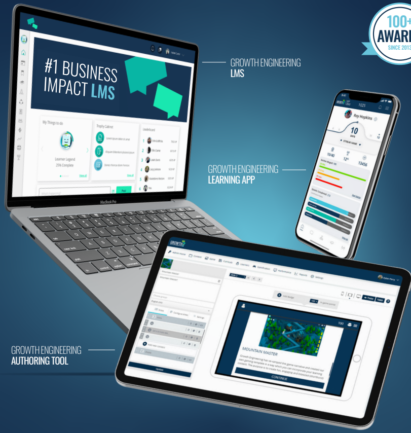
GROWTH ENGINEERING LMS

Whatever learning problem you're trying to solve, we can help. The Impact Suite combines three multi-award winning products with expertise from the Growth Engineering team to create the ultimate end-to-end learning solution.